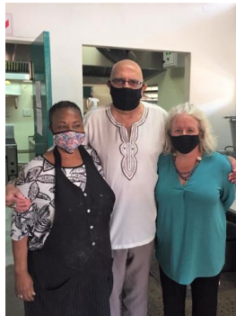
An interfaith visit by the US CG