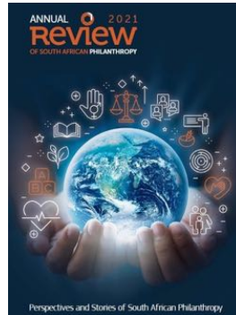
DHC featured in prestigious publications