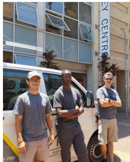
Why are these men climbing on our roof?